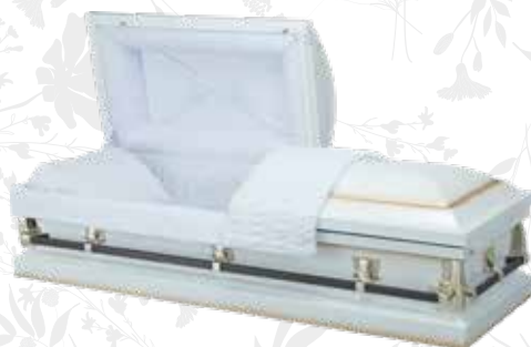
American-Style Caskets* American-style Caskets are available in wood or metal in a wide selection of designs From £1,470