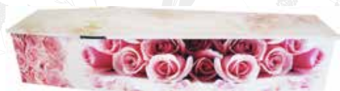
Reflections – Personalised Picture Coffins Choose from a ready-made design or design your own £920