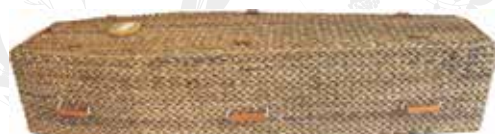
Banana Leaf – Coffin shape* (also available in Casket shape*) £995