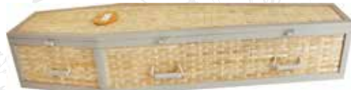
Premium Bamboo* £720