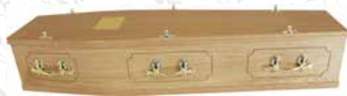
Rochester – Oak Veneer £520