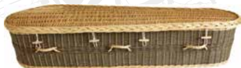
Personalised English Willow (Wicker) Hand-woven in Somerset, personalised to your specification £1,120