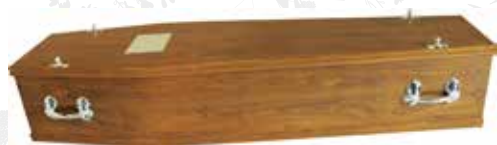
York – Oak Effect Foil Veneer £445