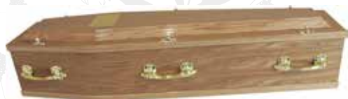
Worcester – Oak Veneer (also available in Mahogany) £595