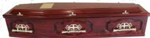
Windsor – Semi-Solid Mahogany (also available in Oak) £720