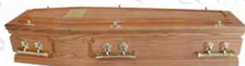
Westminster – Solid Oak (also available in Mahogany) £865