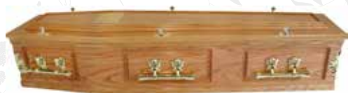
Surrey – Solid Oak (also available in Mahogany) £845