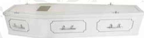
Oxford White – White Painted Veneer (also available in a range of colours - £720) £670